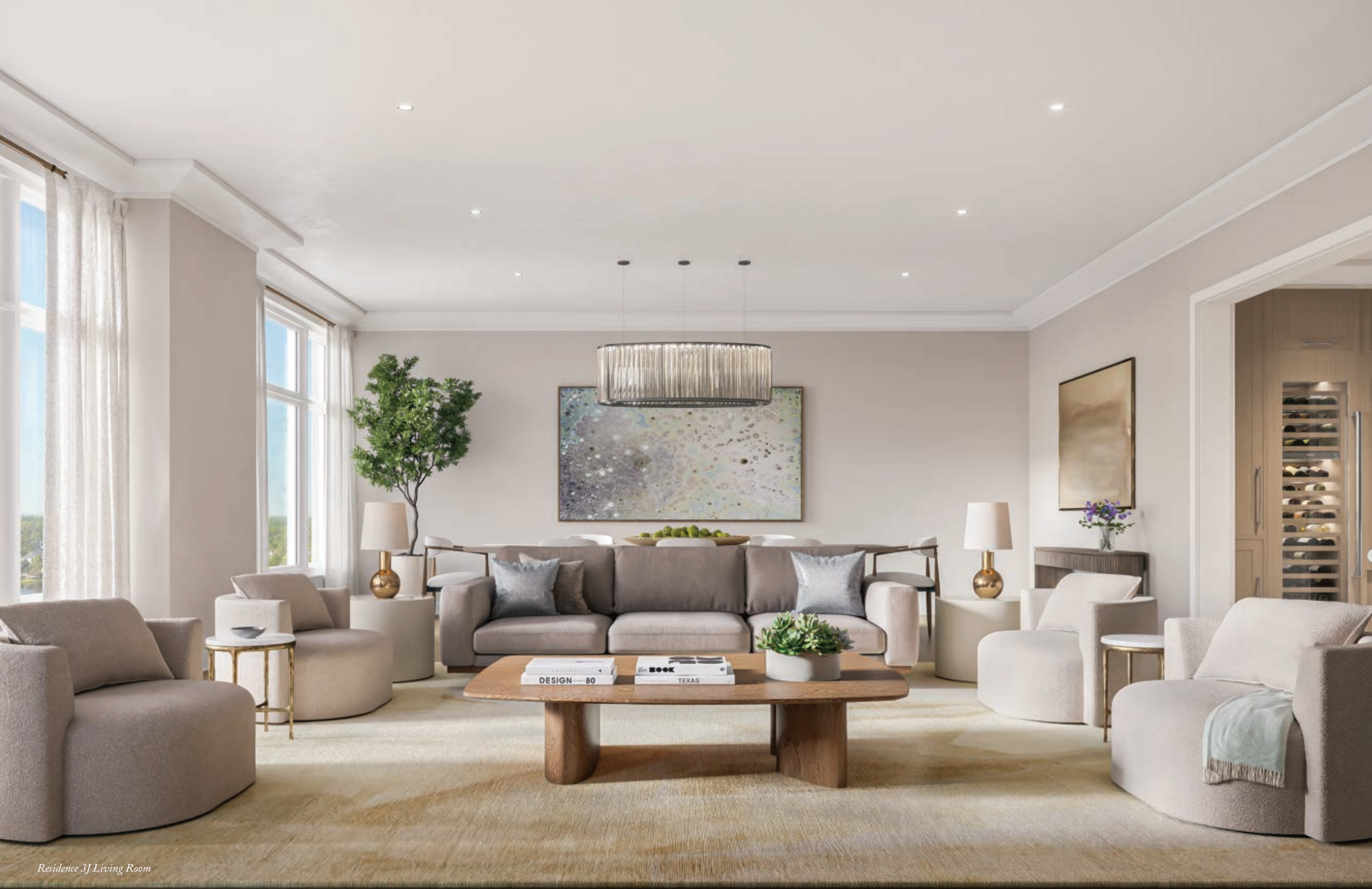
Residence 3J Living Room