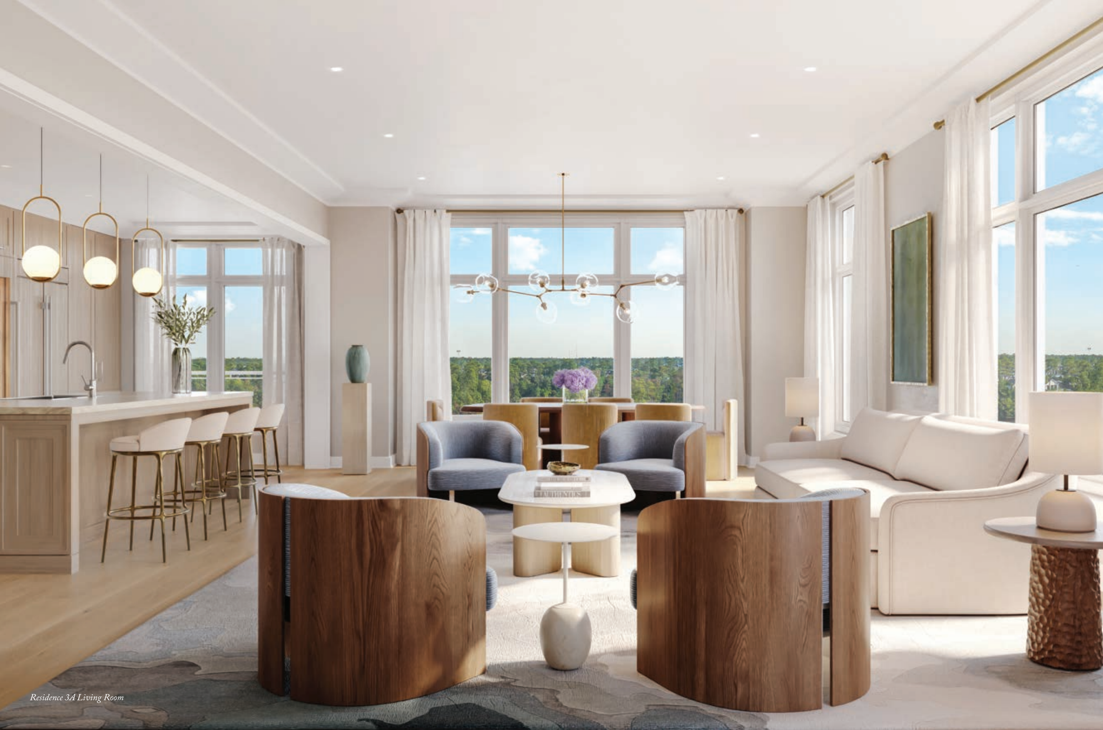
Residence 3A Living Room