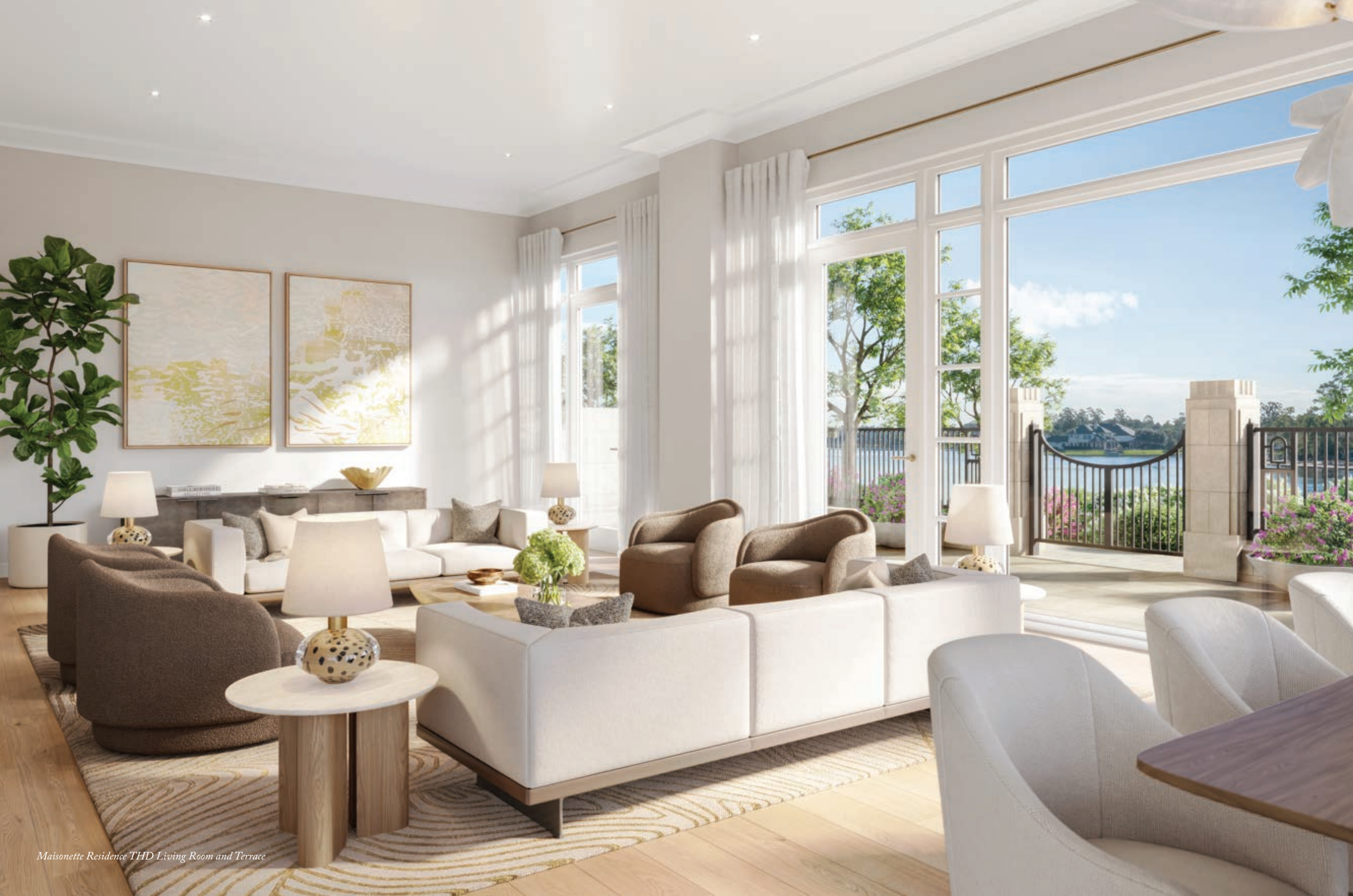
Maisonette Residence THD Living Room and Terrace