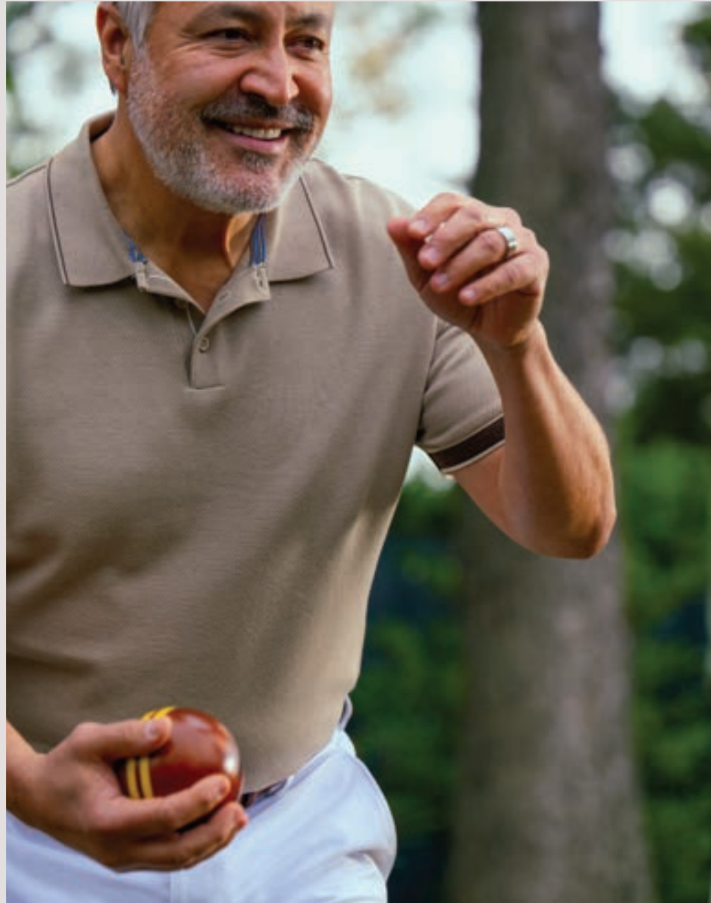
Recreation along the lake