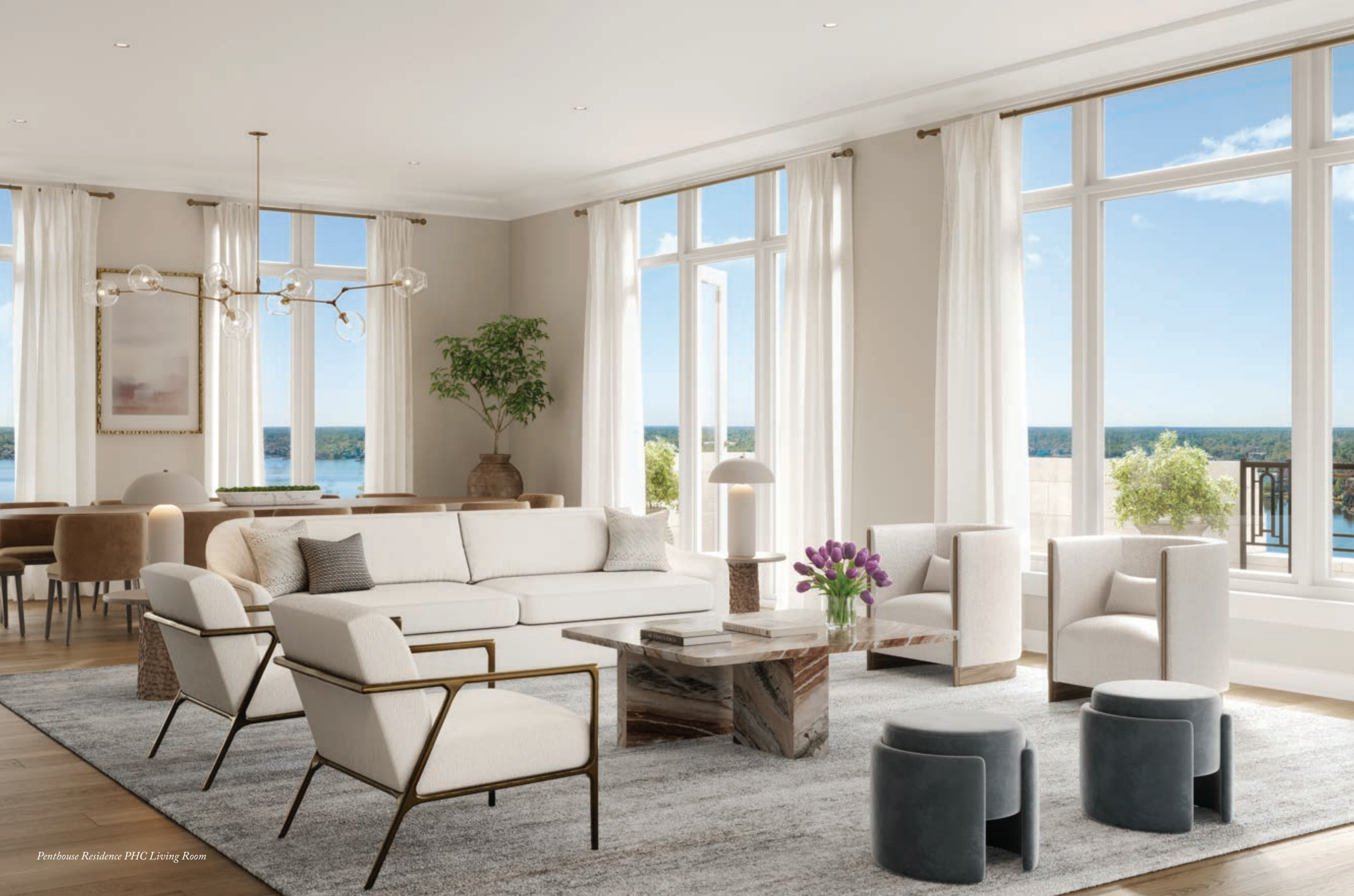
Penthouse Residence PHC Living Room