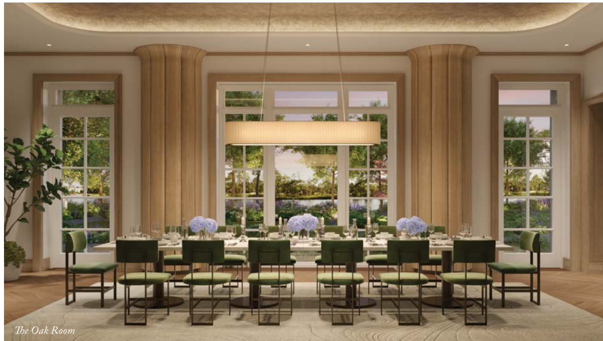
The Oak Room

Robert A.M. Stern ROBERT A.M. STERN ARCHITECTS