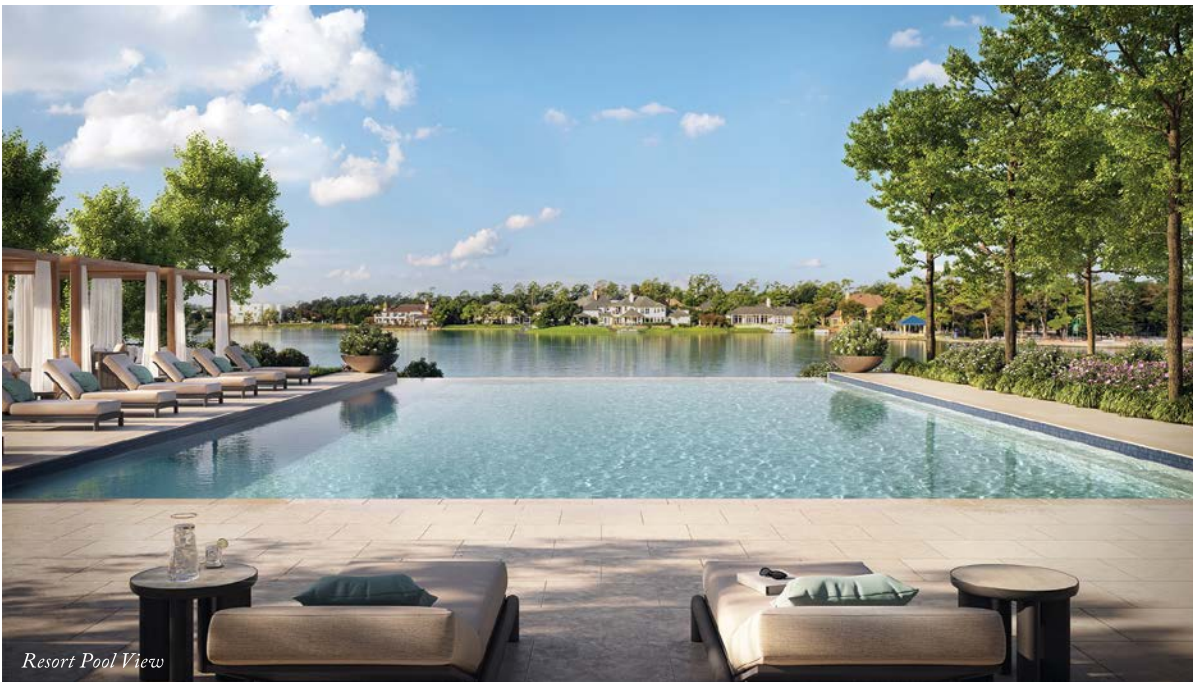
Resort Pool View