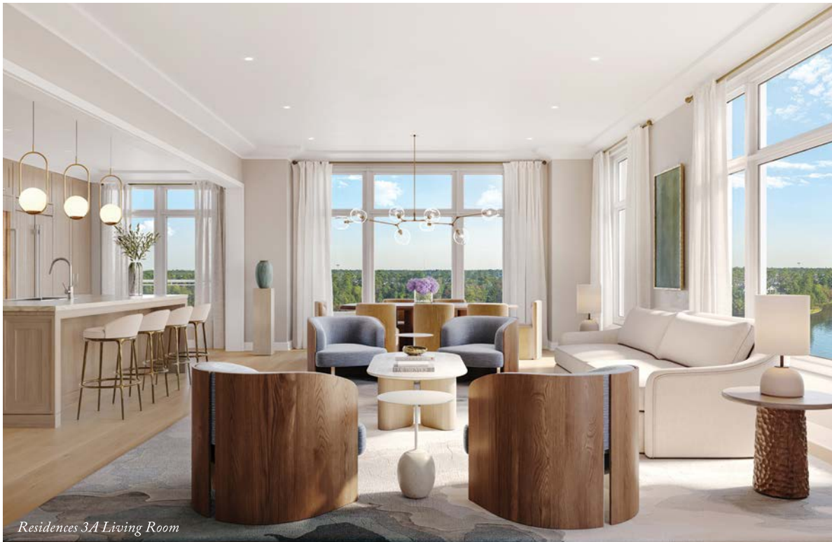
Residences 3A Living Room