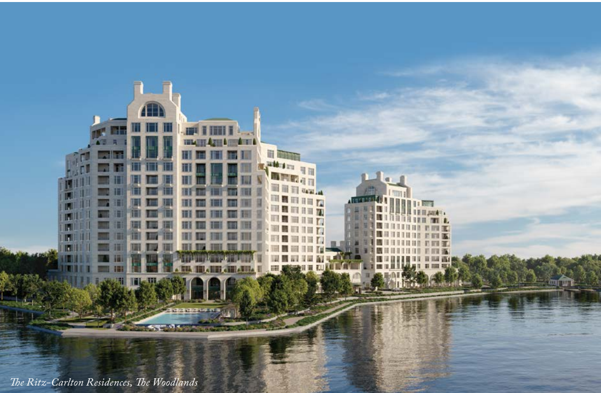
The Ritz-Carlton Residences, The Woodlands